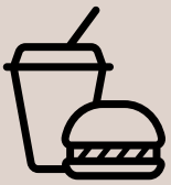
Food & Beverages

Halal Trade, Logistics and Manufacturing Expo will further strengthen Africa's position as a global halal hub and put forward the economic values of Halal for the world.